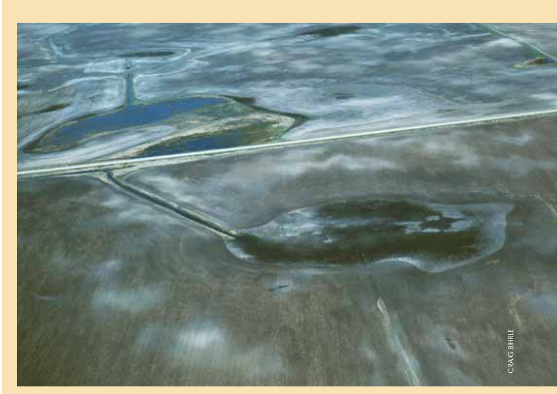
Shortly after forming, the North Dakota Chapter of the Wildlife Society launched plans to curb large-scale wetland drainage in the Prairie Pothole Region.

Largely as a result, President Clinton signed Public Law 105-167 in 1998, directing a mineral exchange of nearly 10,000 acres of privately owned minerals on federal land for other federal minerals. The outcome protected blocks of public land from piecemeal fragmentation of wildlife habitat.